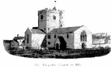
19. Kingsclere Church in 1840.

Our deferred Quiz Night will now be held in the Fieldgate Centre on Friday 22nd April. Doors open at 6.45 p.m., and the Quiz starts at 7.30 p.m. prompt. Numbers are limited to 100, so early booking is recommended!