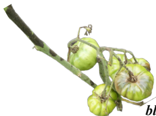
blight on tomato plant

Harvest early apples and pears, these will need to be used quickly as they do not store well. It's time to remove old raspberry canes, taking out the canes that have fruited, leaving the thinner new ones to mature.