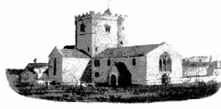
St. Mary's Church in 1865