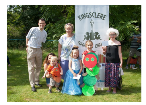
Entries from our Costume Competition