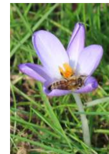
honeybee on crocus

Spring is certainly starting to reveal her colours, with the bright yellow daffodils nodding to us from the roadsides and the branches of the cherry trees popping with pink and white blossom. We were surprised to already hear - and then see - two large bumblebees busy collecting nectar from crocuses in our front garden.