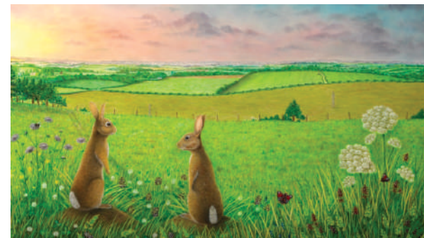
The Whole World © Aldo Galli

An exhibition of Watership Down Paintings by Aldo Galli.