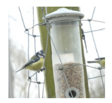
Blue Tits on a garden bird feeder

It was good to see that the autumnal rains had restored Greenham Common to its usual state when we visited a few weeks ago. There was a time last year when it was looking so dry and parched but now all the scrapes and deeper ponds are filled much to the relief of wildlife and livestock. There is not much high ground but if a mound is climbed there is an attractive view across a mini 'Lake District'. We paid a visit for the first time to the control tower and enjoyed learning about history of the Common, particularly its last eighty years. The view from the top, with its all round view showed its huge expanse and what a bonus it is to local people and as a nature reserve. It was encouraging to see a flock of approximately fifty lapwings and also a gathering of ten magpies, the collective noun of which apparently, is a 'tiding'.