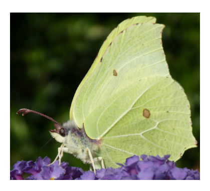
Butterflies on buddleia - left Red Admiral, right Brimstone

A cuckoo was heard at last on July 1<sup>st</sup> this year. Surely this was very late in the year for this spring migrant. The bird was calling from Monty Don's Garden on Gardener's World programme. This sound was the herald of spring in our childhood and was unheard for the first time. The high- pitched scream of swifts over the village are absent also - the times they are a-changing! On a cheerier note: Blue and great tits have produced numerous chicks and once declining starlings seem to be doing well locally. A local ash tree has been systematically stripped of young foliage by woodpigeons. Four or five birds at a time consume the fresh green growth leaving a very sparse canopy. Oak, sycamore and maple leaves are ignored.