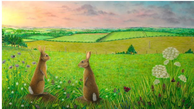
The Whole World © Aldo Galli

A new display of paintings will allow visitors to relive moments of the novel Watership Down while being able to enjoy the landscape which inspired the much-loved children's book.